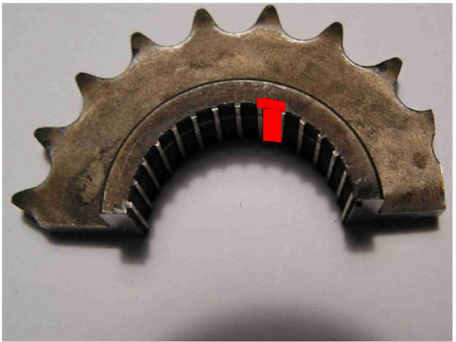
Figure 1. Gen III camshaft drive sprocket courtesy of Bob Gervais. Downloaded with permission from www.v8sho.com. The red detail of suggested adhesive void fill was added by B.C. Lamartine per a suggestion from Tim Wright. Adhesive fill must be replicated for all sprocket voids.

Figure 1 below shows the application of the adhesive to one available void. Subsequent modeling assumes application to all voids.